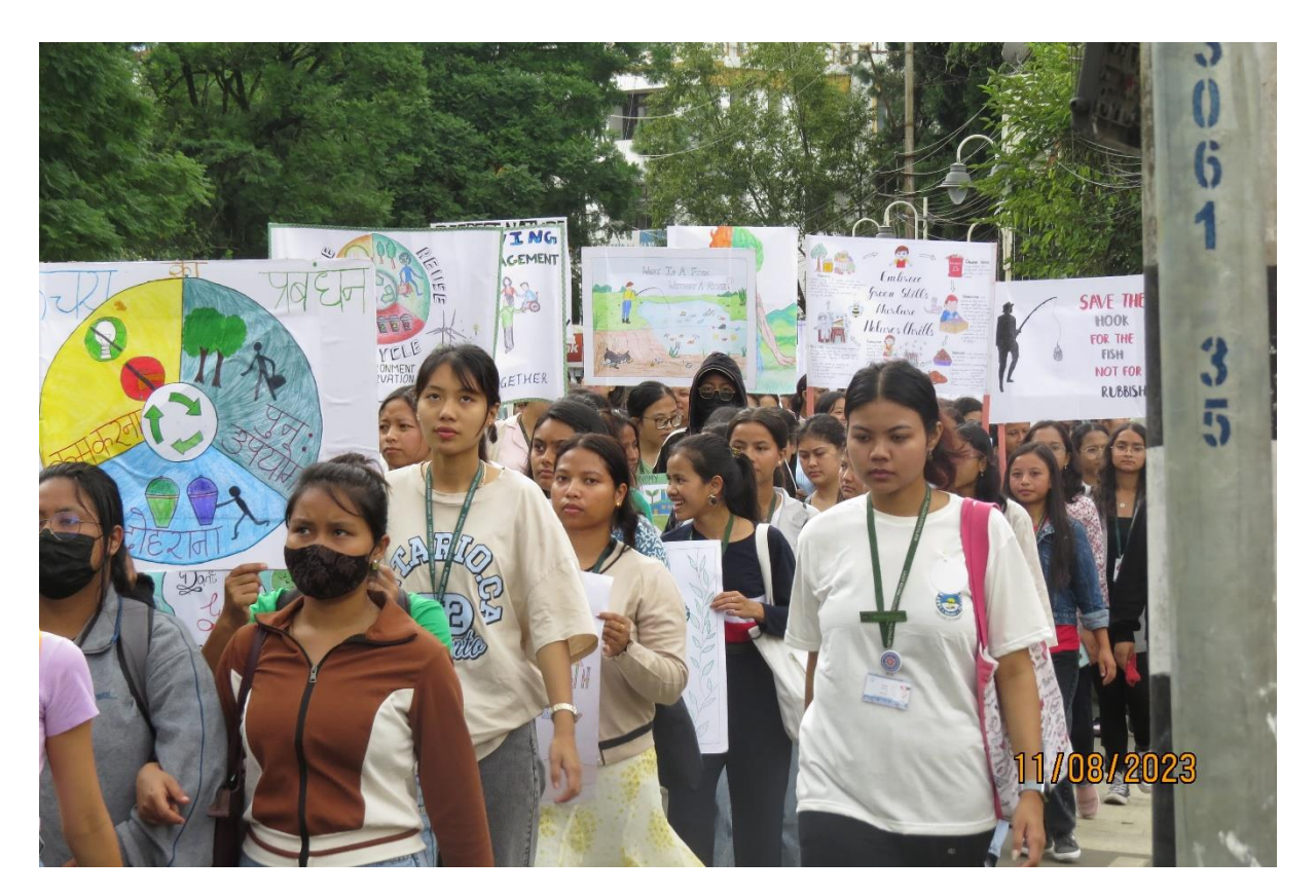
Pic 4: The Rally in progress