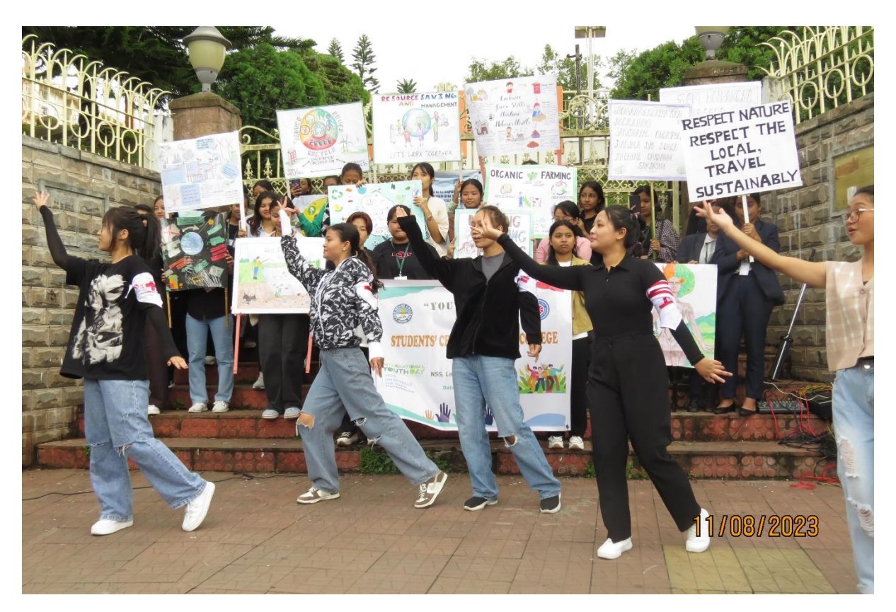
Pic 7: Flash Mob at Police Bazar performed by the Youth Red Cross