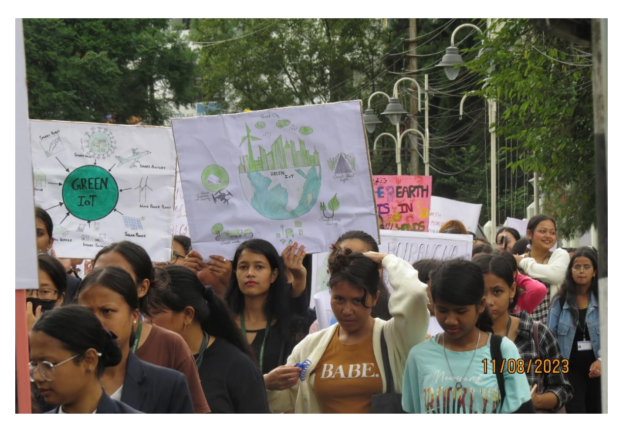
Pic 5: The participants at the rally