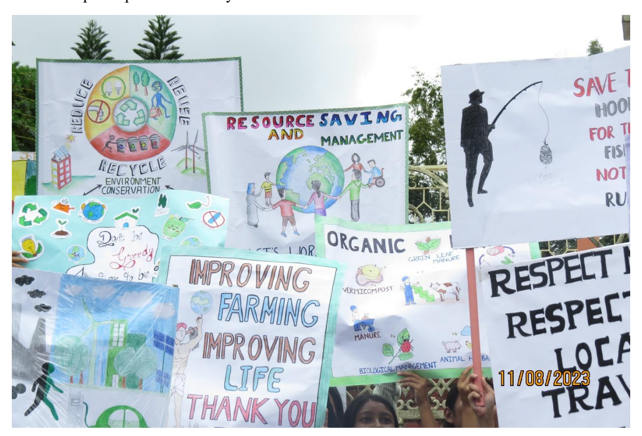
Pic 6: Some of the Posters and Banners